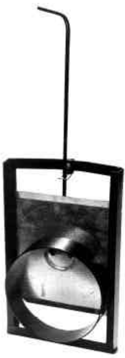
C-8E with Metal Seat