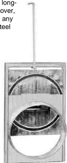
C-8 with Gasket Seat